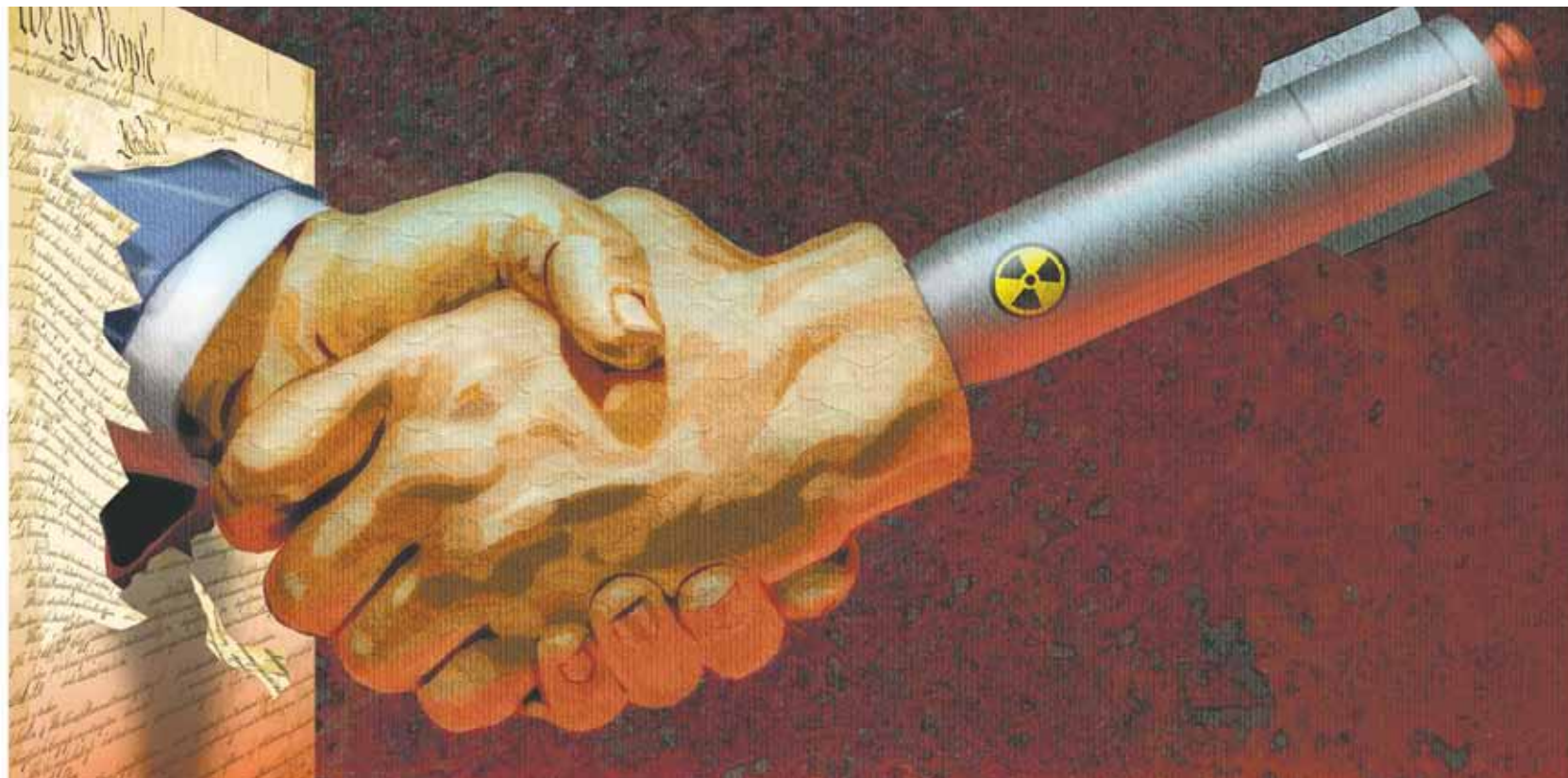
ILLUSTRATION BY HUNTER