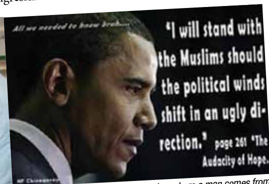
We must always remember where a man comes from.