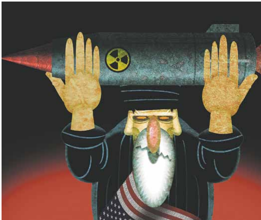
ILLUSTRATION BY HUNTER

A deal that surrounds Israel not only with a nuclear Iran, but also eventually with numerous other regimes with nuclear weapons capability and a genocidal attitude toward the Jewish State makes war more likely.