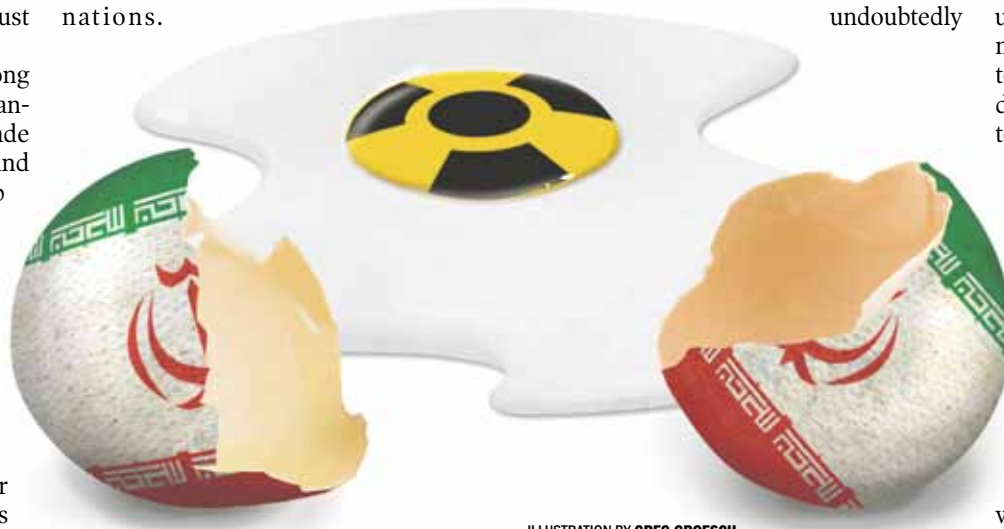
ILLUSTRATION BY GREG GROESCH

Therefore, I will vote to disapprove the agreement, not because I believe war is a viable or desirable option, nor to challenge the path of diplomacy. It is because I believe Iran will not change, and under this agreement it will be able to achieve its dual goals of eliminating sanctions while ultimately retaining its nuclear and non-nuclear power.